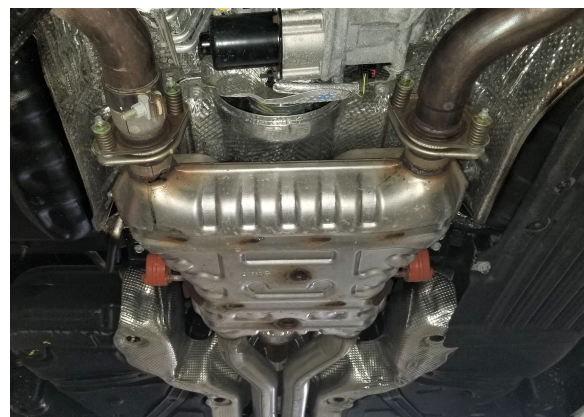
Detail 5: (4) nuts at catback connection