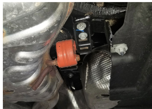
Detail 6: Middle resonator hangers.