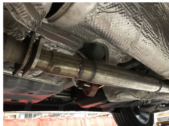
Detail 9: Inlet to X-pipe w/ hanger installed (Legend center muffler shown)