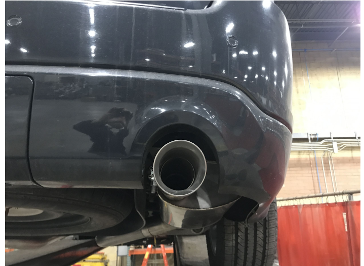
Detail 12: Right muffler assembly with tip installed

After double checking for clearance and making sure all lines, wires and hoses are secured, drive the vehicle for 10-20 miles and re-check all clamps and clearances. Your system may be tack welded at the joints/ clamps to reduce shifting of the system during heating and cooling cycles. Make certain to disconnect the battery before performing any welding.