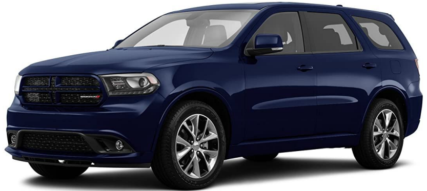
2011+ Dodge Durango 5.7L (DUR11CBx)

Thanks for purchasing a Stainless Works catback exhaust system for your 2011+ Dodge Durango 5.7L. Our team has worked to ensure that this product is the premium in performance, quality, and fitment. We are proud to say that this system will unleash the true character of your vehicle. We encourage you to read through the following steps, and check the included Bill of Materials before beginning. Please follow these steps to ensure that your installation goes as planned.