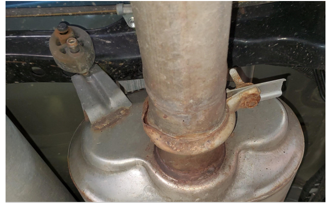
Detail 3: Rear OEM tailpipe connection