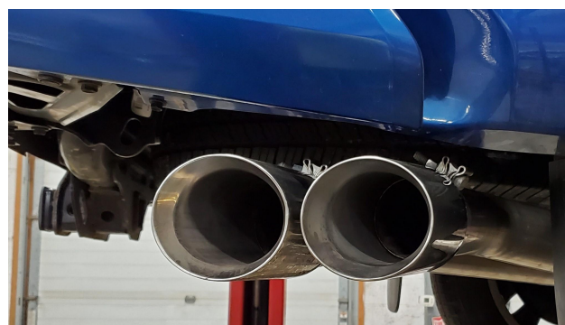
Detail 12: Tips installed.