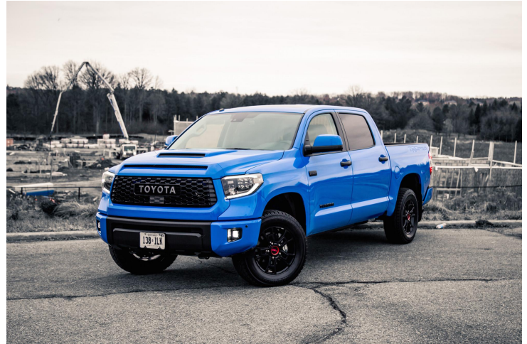
2019+ Toyota Tundra TRD Pro CrewMax SR5 (TOYT14XXX)

Thanks for purchasing a Stainless Works catback exhaust system for your 2014+ Toyota Tundra. Our team has worked to ensure that this product is the premium in performance, quality, and fitment. We are proud to say that this system will unleash the true character of your vehicle. We encourage you to read through the following steps, and check the included Bill of Materials before beginning. Please follow these steps to ensure that your installation goes as planned.