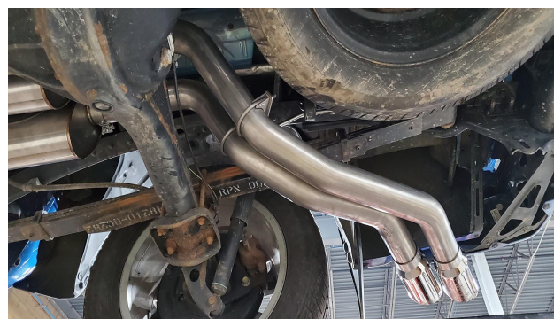
Detail 11: Tailpipes with hanger bracket.