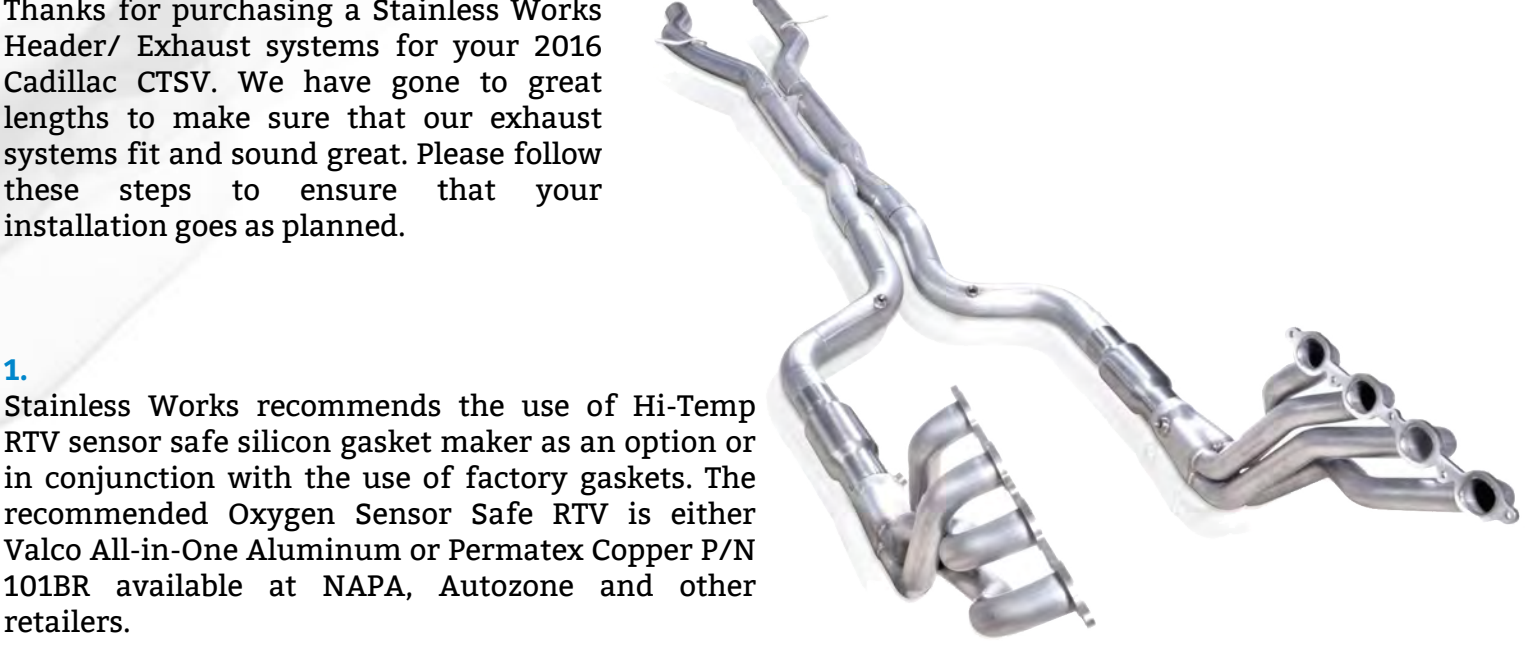
CTS-V Header System

You will assemble the components together as specified below, but only snug the clamps as you move along from front to back. When placing the X-pipe into position, make certain that you push it fully forward and level it with the vehicle. After aligning all the components in the vehicle, you will tighten all the clamps working from front to back of the vehicle.