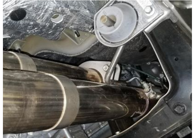
Detail 12: Inlet connection and X-pipe installed

18. After double checking for clearance and making sure all lines, wires and hoses are secured, drive the car for 10-20 miles and re-check all clamps and clearances. Your system may be tack welded at the joints/ clamps to reduce shifting of the system during heating and cooling cycles. Make certain to disconnect the battery before performing any welding.