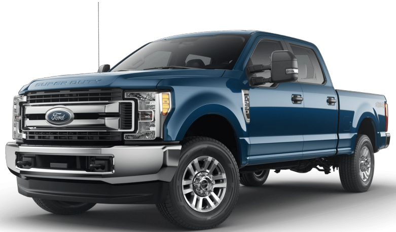
2017+ F250 6.2L (FT217CBFT)

Thanks for purchasing a Stainless Works catback exhaust system for your 2017+ Ford F250 6.2L. Our team has worked to ensure that this product is the premium in performance, quality, and fitment. We are proud to say that this system will unleash the true character of your vehicle. We encourage you to read through the following steps, and check the included Bill of Materials before beginning. Please follow these steps to ensure that your installation goes as planned.