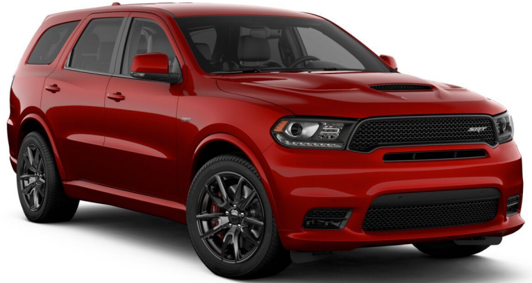
2018+ Dodge Durango SRT 6.4L (DUR18H)

Thanks for purchasing a Stainless Works header system for your 2018+ Dodge Durango SRT 6.4L. Our team has worked to ensure that this product is the premium in performance, quality, and fitment. We are proud to say that this system will unleash the true character of your vehicle. We encourage you to read through the following steps, and check the included Bill of Materials before beginning. Please follow these steps to ensure that your installation goes as planned.