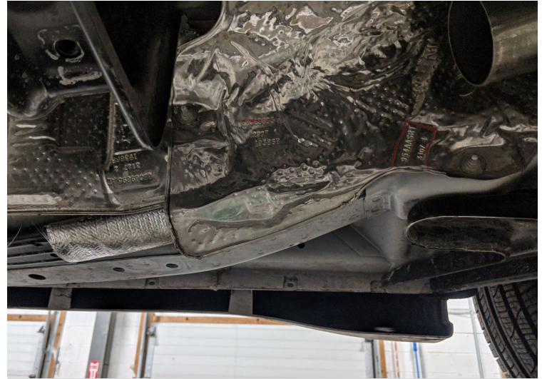
Detail 23: Left side heat shield