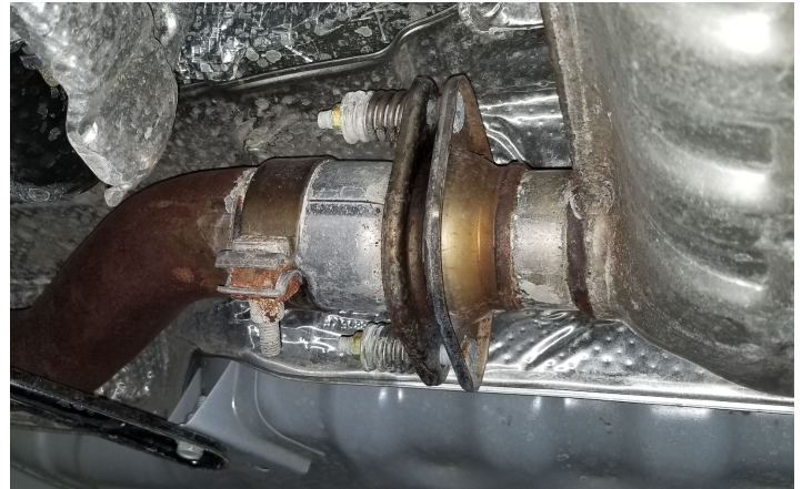
Detail 6: Flanged catback connection