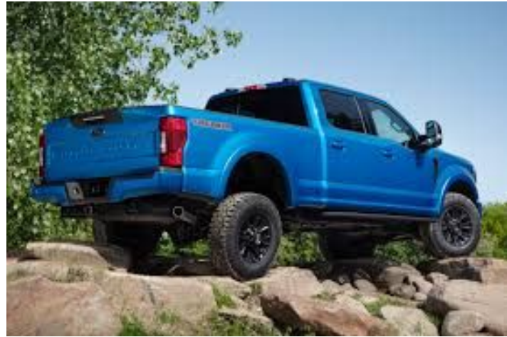
2020 + F250 7.3L (FT220188/2202HCAT)

You will assemble the components together as specified below, but only snug the clamps as you move along from front to back. After aligning all the components in the vehicle, you will tighten all the clamps working from front to back of the vehicle.