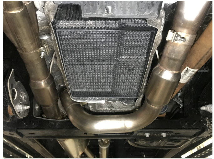
Detail 19: Headers and leads installed