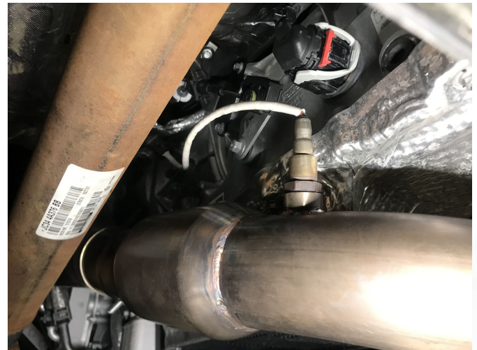
Detail 22: O 2 sensor installed