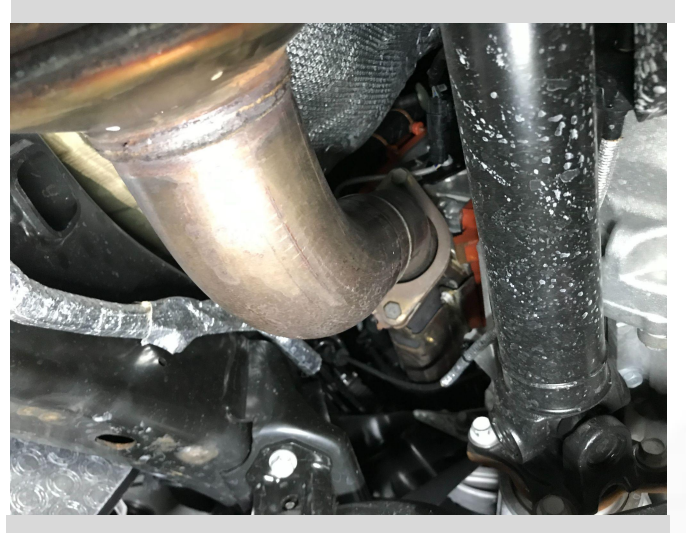
Detail 6: Driver flanged connection at manifold

Detail 4: Passenger flanged catback connection