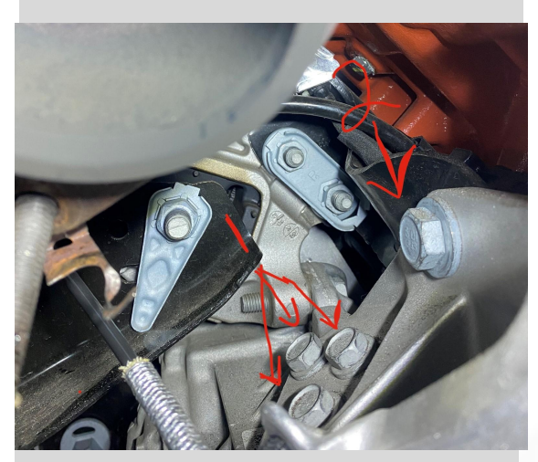
Detail 19 & 20