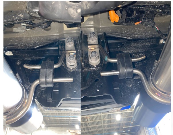
Detail 13: Tips and hangers installed correctly