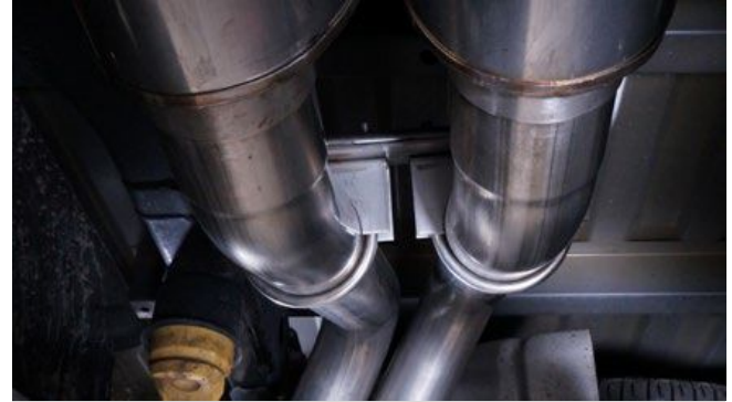
Detail 9: Front tailpipe hanger