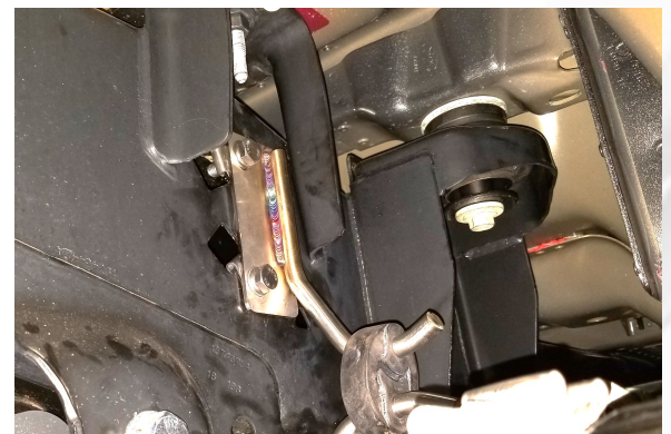
Detail 9: Frame hanger and grommet installed.