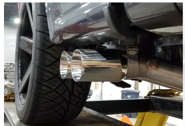
Detail 11: Tips installed.