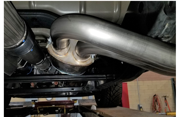
Detail 10a: Tailpipes installed to muffler.

14. After double checking for clearance and making sure all lines, wires and hoses are secured, drive the truck for 10-20 miles and re-check all clamps and clearances. Your system may be tack welded at the joints/ clamps to reduce shifting of the system during heating and cooling cycles. Make certain to disconnect the battery before performing any welding.