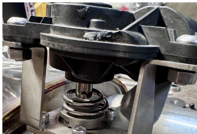
Detail 5: Valve motor mounted with spring and mounting screws.