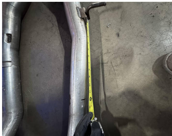
Detail 1: Cut 13.5 inches of the driver side and 12 inches off of the passenger side.