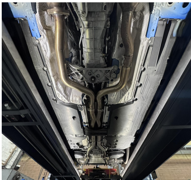
Detail 25: Cat-back System Installed