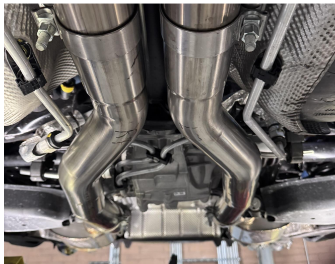
Detail 12: Stainless Works muffler leads to factory grommets