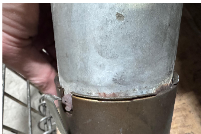
Detail 6: Metal clip to bend in order to remove tubes