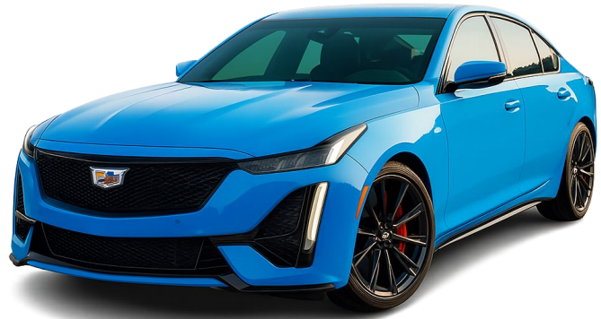
2022+ Cadillac CT5V Blackwing

Thanks for purchasing a Stainless Works system for your 2022+ Cadillac CT5V Blackwing. Our team has worked to ensure that this product is the premium in performance, quality, and fitment. We are proud to say that this system will unleash the true character of your vehicle. We encourage you to read through the following steps, and check the included Bill of Materials before beginning. Please follow these steps to ensure that your installation goes as planned.