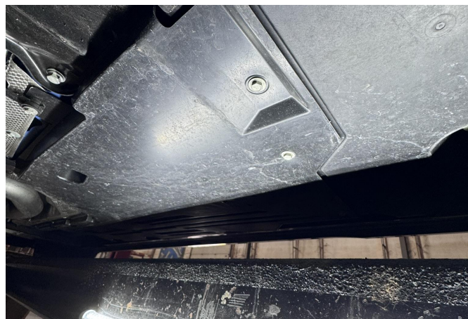
Detail 2: Plastic to remove bolts from