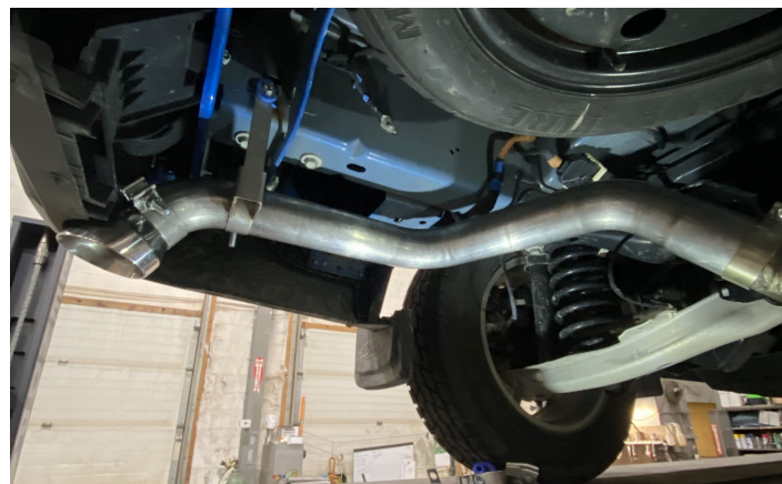
Detail B: HC tail assembly installed