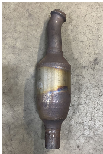
Detail 7: a properly cut secondary cat