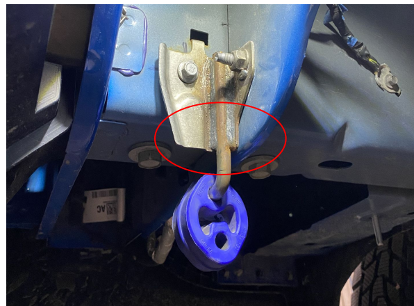
Detail 5: location of the bolts to remove the factory hanger bracket.