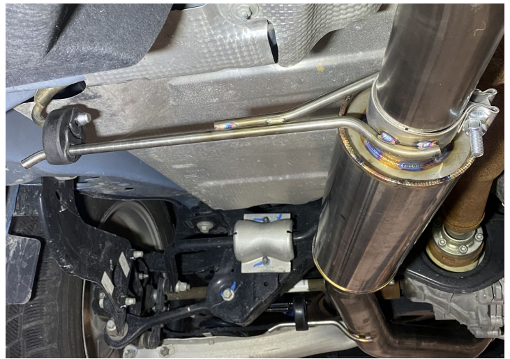
Detail 5: SPECIAL WIRE HANGER installed