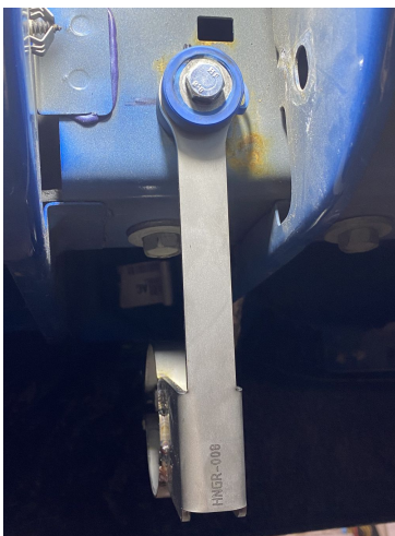
Detail B-b: SPECIAL HANGER HC installed