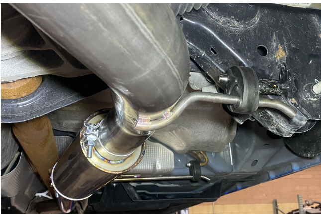
Detail 7: muffler outlet installed w/ clamp/hanger