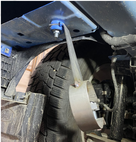
Detail A-b: SPECIAL HANGER DT installed