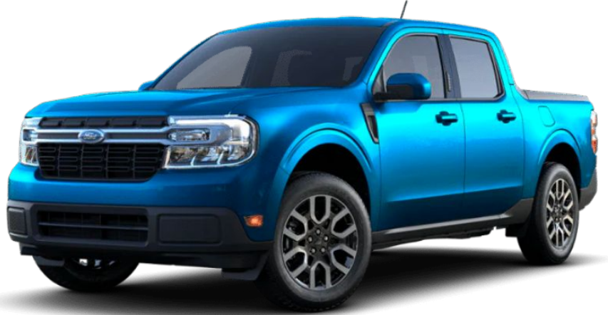
2022+ Ford Maverick (FMAVCB)

Thanks for purchasing a Stainless Works catback exhaust system for your 2022+ Ford Maverick. Our team has worked to ensure that this product is the premium in performance, quality, and fitment. We are proud to say that this system will unleash the true character of your vehicle. We encourage you to read through the following steps, and check the included Bill of Materials before beginning. Please follow these steps to ensure that your installation goes as planned.