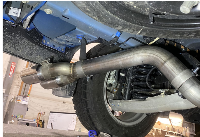
Detail A: DT tail assembly installed