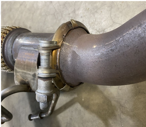
Detail 3: reference picture of factory clamp.