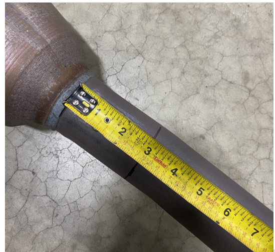
Detail 6: how to mark out your cut.