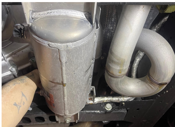
Detail 5: Unbolt and move air tank to the side. .