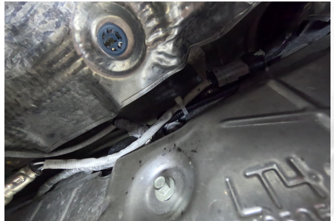
Detail 25: O 2 extension ran over the transmission, zip tied in place.