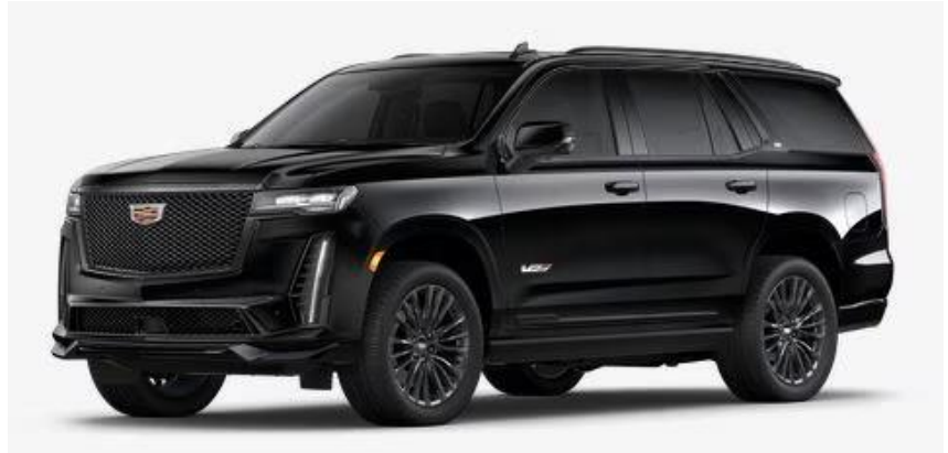
2023+ Cadillac Escalade V (ESCV23HCAT)

Thanks for purchasing a Stainless Works Header system for your 2023+ Cadillac Escalade V. Our team has worked to ensure that this product is the premium in performance, quality, and fitment. We are proud to say that this system will unleash the true character of your vehicle. We encourage you to read through the following steps, and check the included Bill of Materials before beginning. Please follow these steps to ensure that your installation goes as planned.