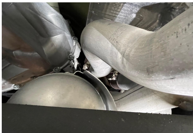
Detail 3: OEM Connection Point .