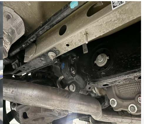
Figure 3: reference picture of the rear end hangers