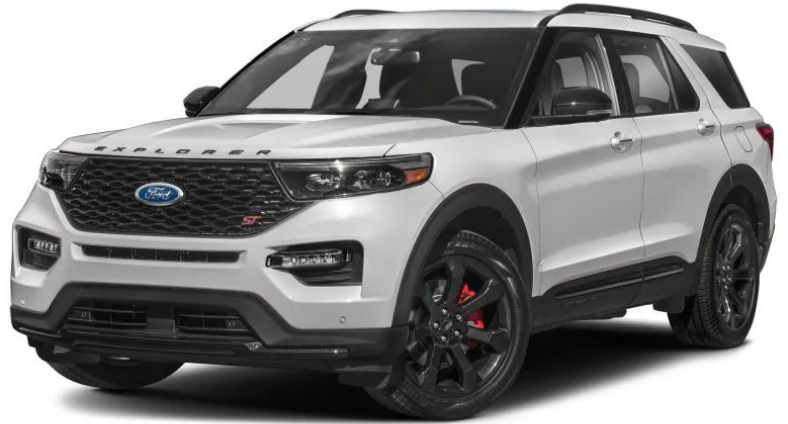
2024+ Ford Explorer ST (FECB)

Thanks for purchasing a Stainless Works Catback for your 2024+ Ford Explorer ST. Our team has worked to ensure that this product is the premium in performance, quality, and fitment. We are proud to say that this system will unleash the true character of your vehicle. We encourage you to read through the following steps, and check the included Bill of Materials before beginning. Please follow these steps to ensure that your installation goes as planned.