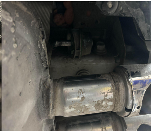
Figure 2: reference picture of the rear hanger holding the mufflers