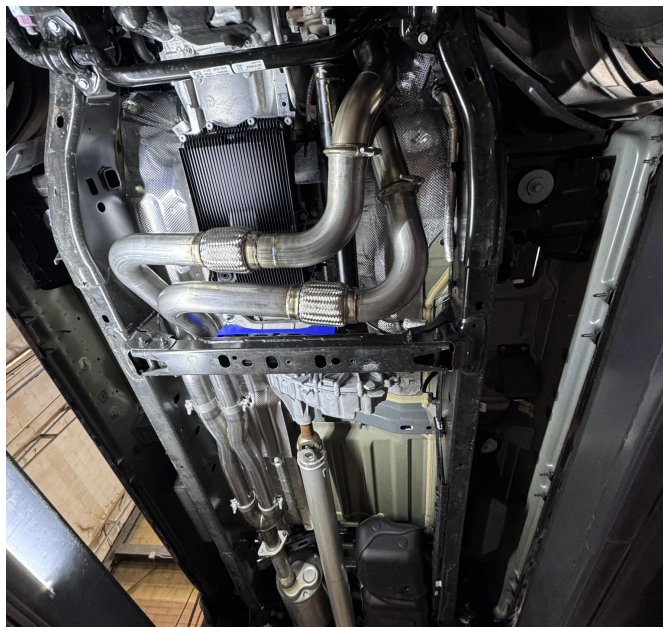
Stainless Works Downpipe to Midpipe