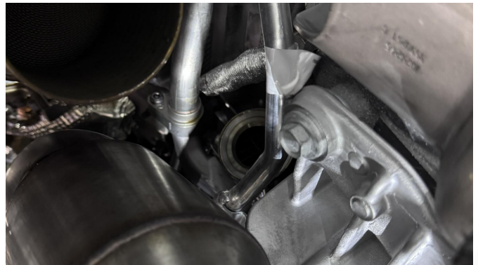
Detail 12: Wastegate location in vehicle