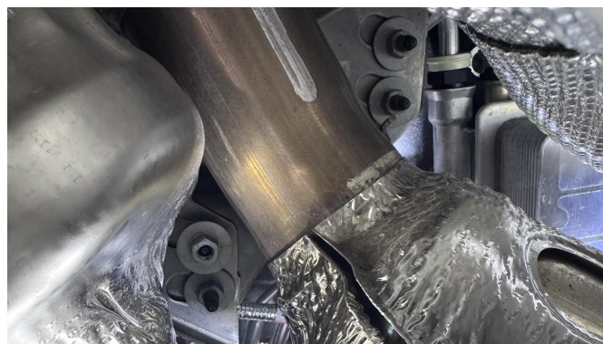
Detail 10: 4 bolts at bottom of downpipe