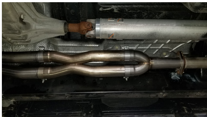
Factory Connect Configuration

20. Adjust and tighten the system from front to back.