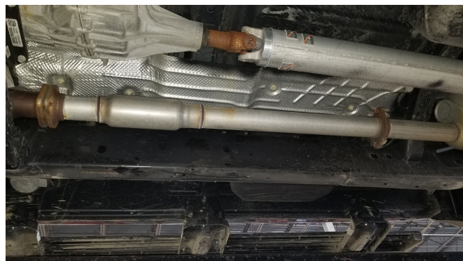
Detail 3: OEM mid section