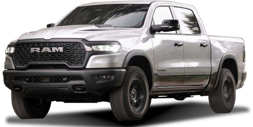
2025 Ram 1500 (RAM25DP)

Thank you for purchasing a Stainless Works Downpipe system for your 2025 Ram 1500. Our team has worked to ensure that this product is the premium in performance, quality, and fitment. We are proud to say that this system will unleash the true character of your vehicle. We encourage you to read through the following steps, and check the included Bill of Materials before beginning. Please follow these steps to ensure that your installation goes as planned.