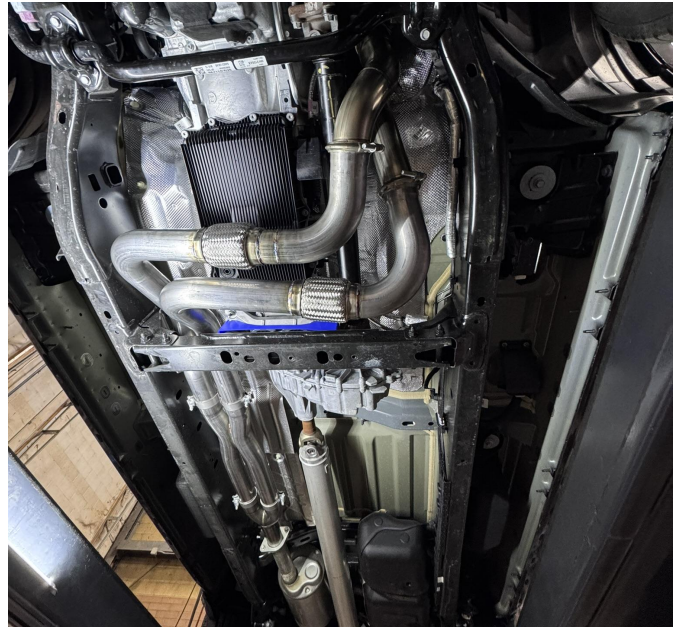
Stainless Works Downpipe to Midpipe