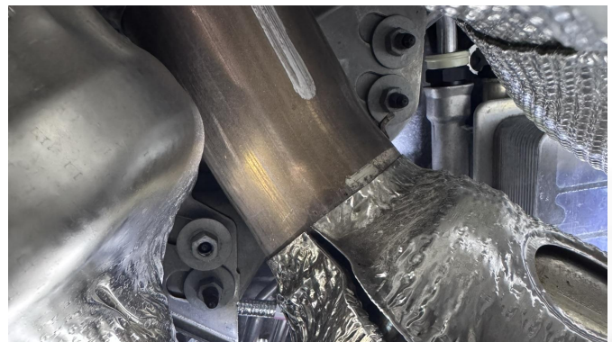
Detail 10: 4 bolts at bottom of downpipe