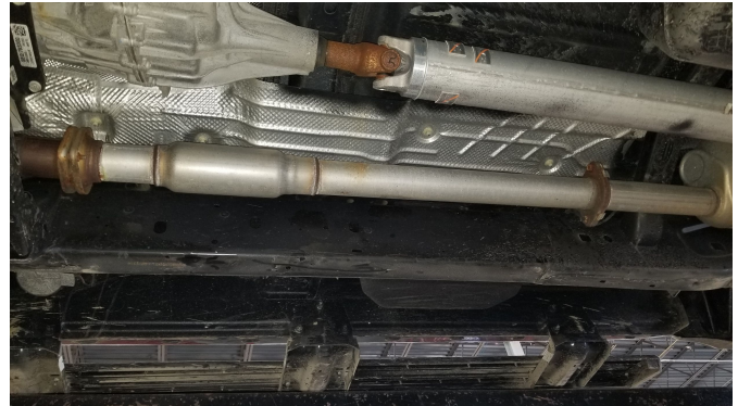
Detail 3: OEM mid section