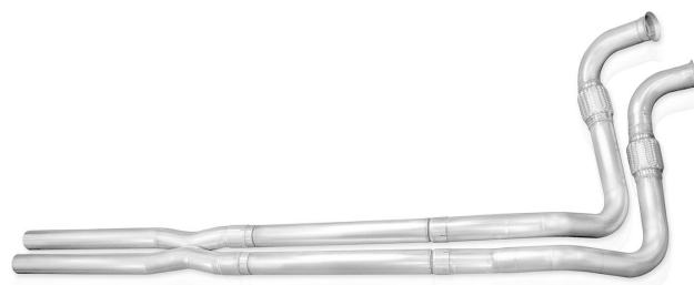
Stainless Works Downpipe to Midpipe