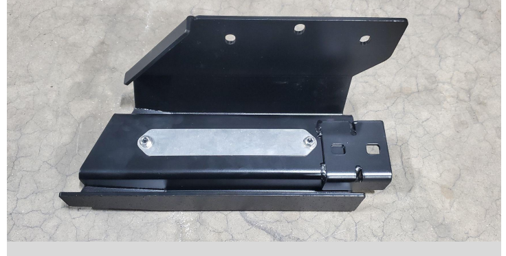
Detail A3: Install backing plate