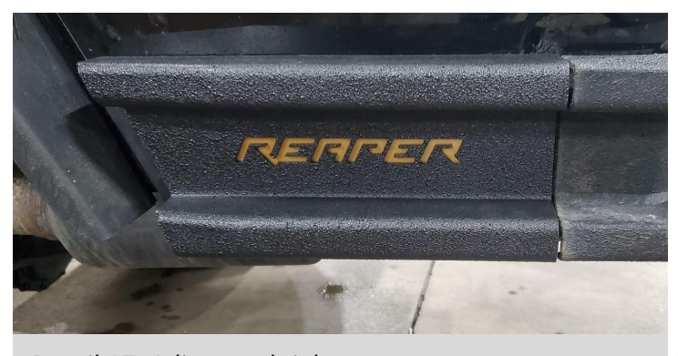
Detail A7: Adjust and tighten