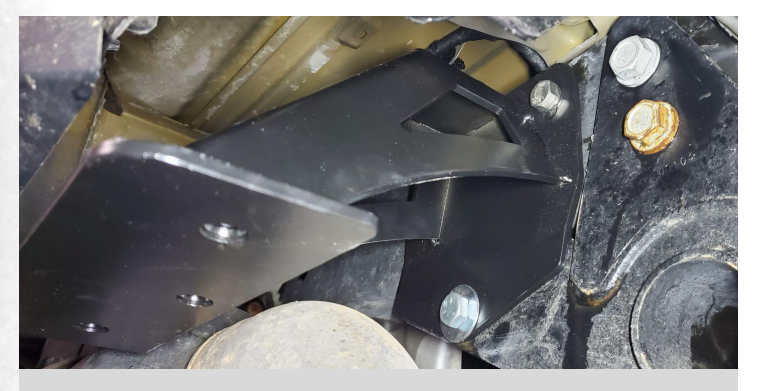
Detail A2: Install driver side mount bracket