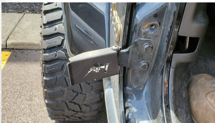
Detail 5: Foot peg installed