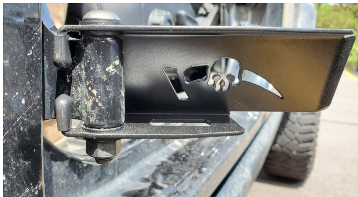
Detail 4: Hardware installed