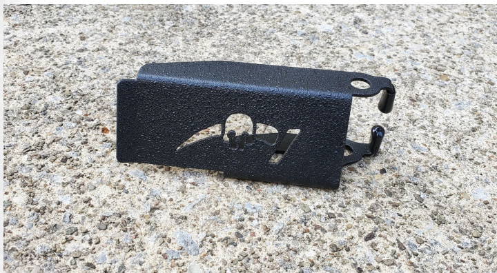
Detail 1: Caps installed