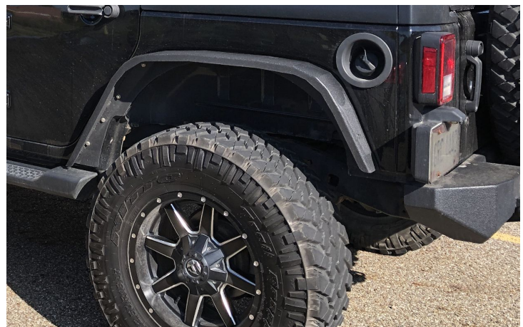
Detail 11: Installation complete