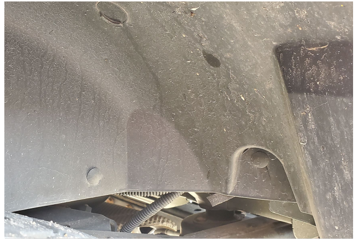
Detail 1: Remove plastic clips inside fender