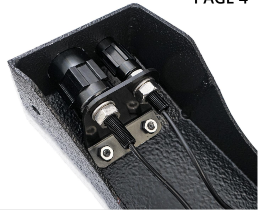
Detail 18: Light assembly installed into fender.