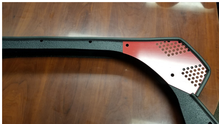
Detail 14: Edge trim installed