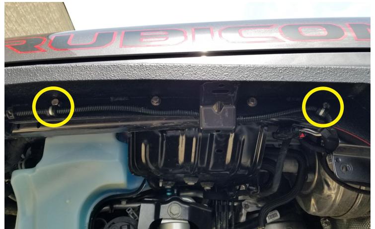
Detail 21: Loop clamps used to secure wiring.