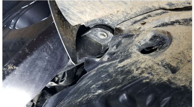
Detail 1: Remove (4) bolts around inside of liner.