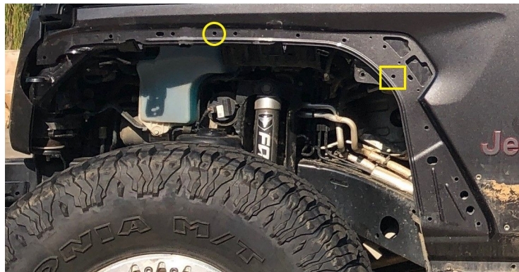
Detail 10: Drill holes to size. Unused hole circled.