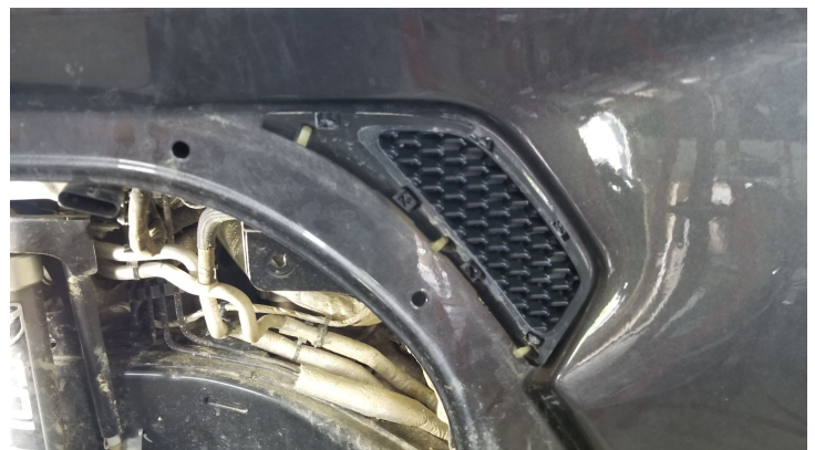
Detail 7: Remove fender vent trim.