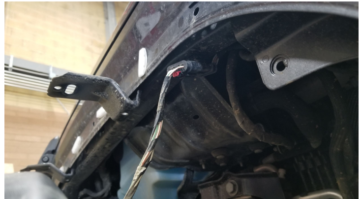
Detail 4: Unplug wire harness.