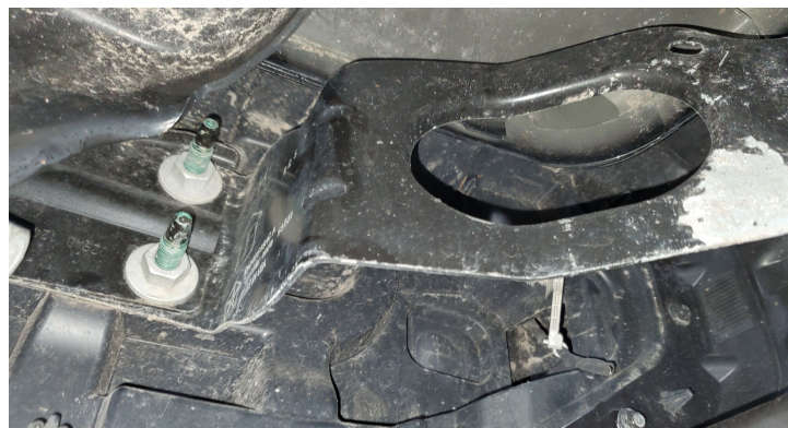
Detail 4: Remove the (2) nuts from each side