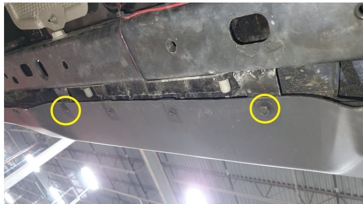
Detail 1: Remove screws under center of bumper