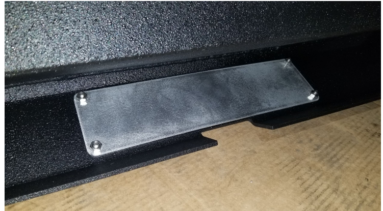
Detail 10: Middle accent plate installed