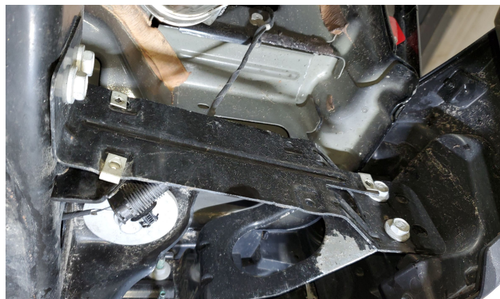
Detail 3: Remove the S-shaped bracket