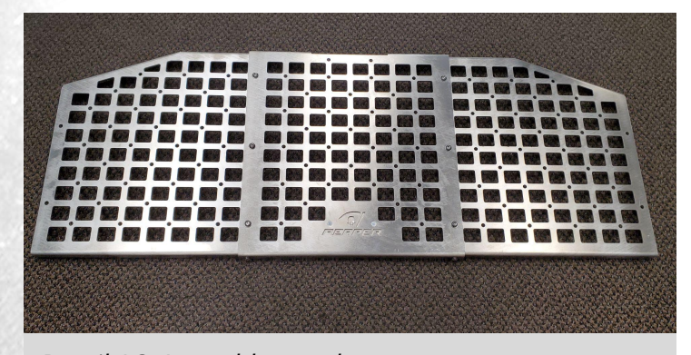
Detail A6: Assemble panels