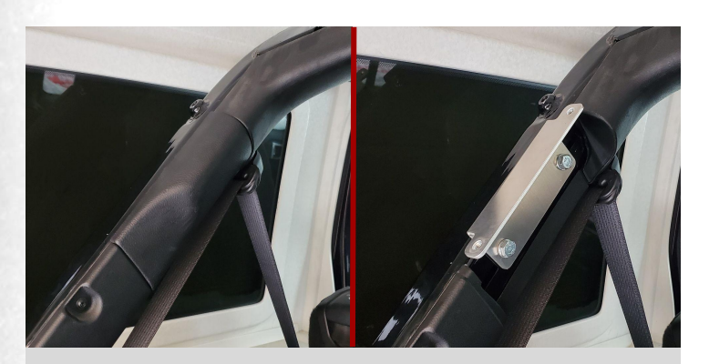
Detail A2: Install side mount brackets