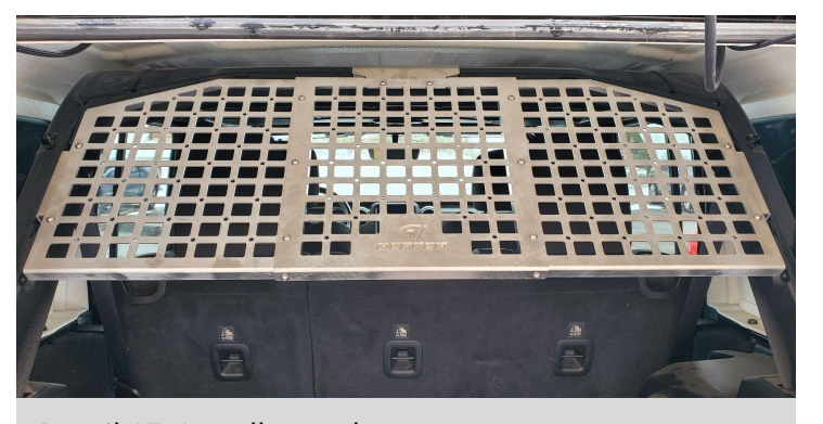
Detail A7: Install complete