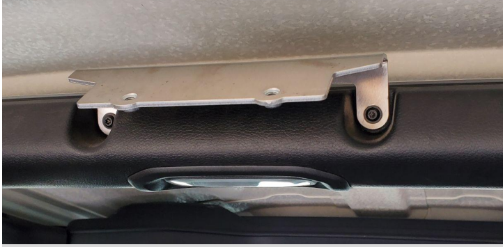
Detail A4: Install top mount bracket