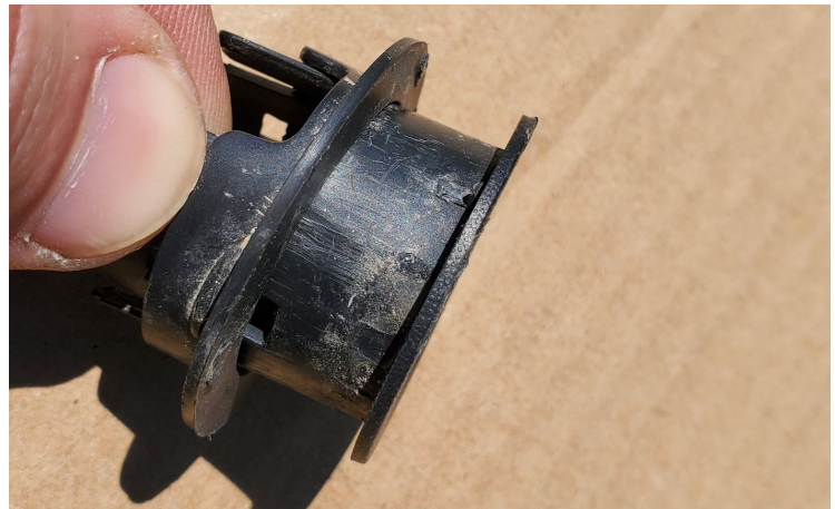
Detail 15: Remove the alignment tabs