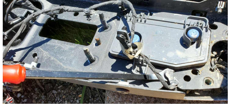
Detail 13: Remove the wire harness