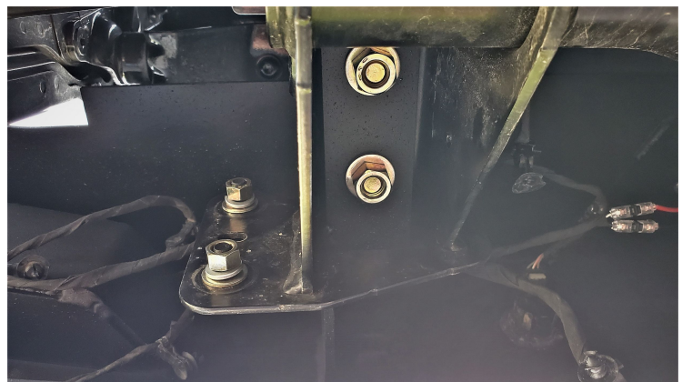
Detail 22: Mounting hardware assembled