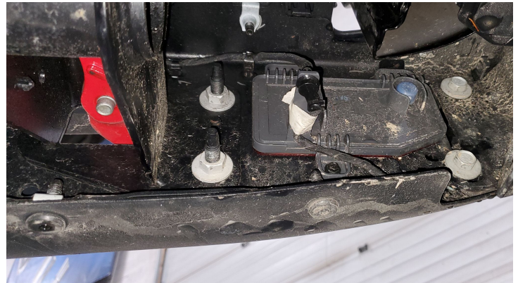
Detail 4: Remove nuts from mounting brackets