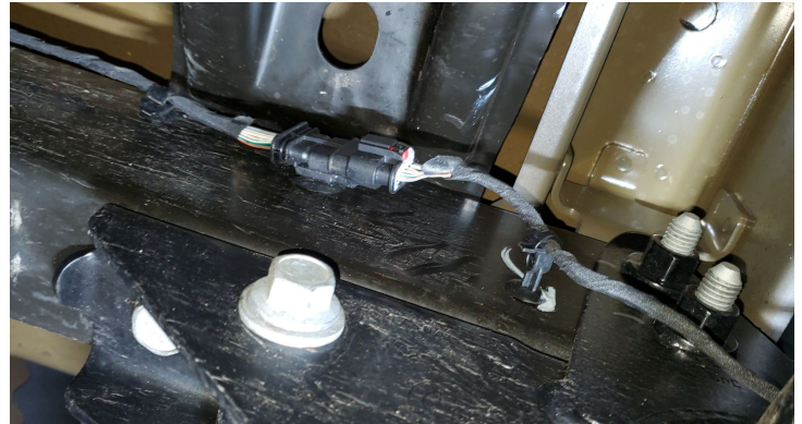
Detail 2: Disconnect all wiring harnesses