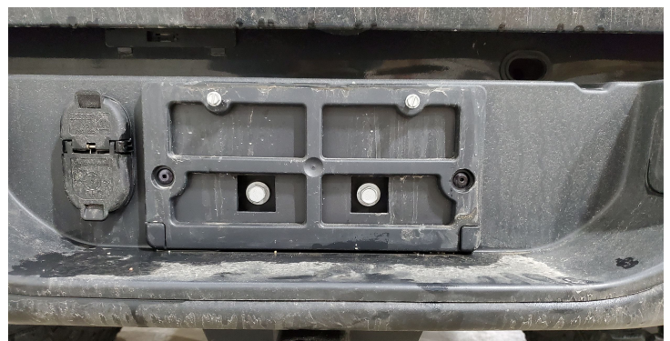
Detail 7: Remove the bolts from the center